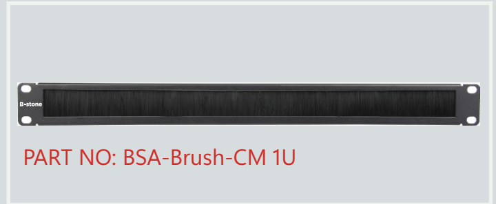
PART NO: BSA-Brush-CM 1U

Blackstone Brush Cable Management Be compatible with 19-inch equipment rack, cabinets, and wall mount shelf, suitable for interaction and termination of horizontal cabling between devices, equipment and centralized points.