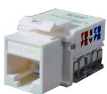
Install dust caps by snapping into plac as shown.